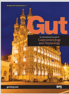
Caption: The beautiful Leuven Town Hall at night. See inside this issue two excellent articles by researchers from Leuven.

An international journal of gastroenterology and hepatology