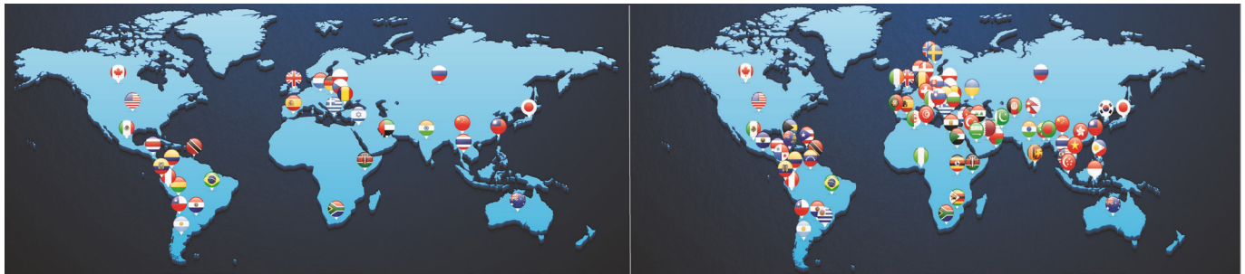
Figure 3 International delegate participation for inperson symposiums (left panel) as compared with online symposiums (right panel).