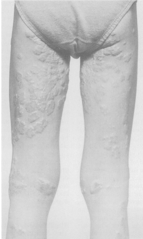
Figure 2: Xanthelasma in a 10 year old boy with Alagille's syndrome.

longation of the prothrombin time. All have hepatomegaly and approximately 50% have splenomegaly. Those presenting with a severe bleeding episode do so at two to six weeks of age. The prothrombin time (prothrombin ratio) is greatly prolonged. It reverts to normal within six hours with intravenous vitamin K. Rarely the presentation is with ascites in the newborn period. The course of the liver disease is independent of the mode of presentation in infancy.