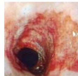
See p 142