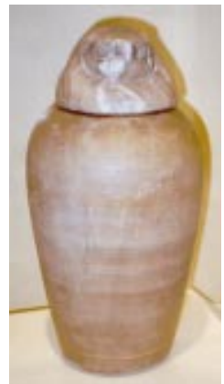
See p 886