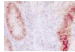
See p 55