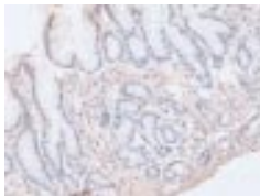
See p 356