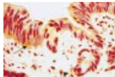
See p 316

NEW ONLINE SUBMISSION GO TO WEBSITE TO SUBMIT YOUR MANUSCRIPT