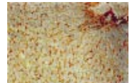
See p 440