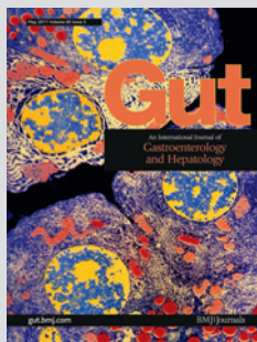
Cover caption: Pancreatic acinar cell. Coloured transmission electron micrograph (TEM) of a slice through several enzyme-secreting acinar cells from a pancreas. The red circles are secretory granules packed with digestive enzymes ready for export to the small intestine. The four round blue and yellow structures are cell nuclei. Each cell is filled with a network of densely folded membrane, called rough endoplasmic reticulum, here coloured light yellow. The membrane's surface is covered in small dots, called ribosomes. These are protein-manufacturing sites where various digestive enzymes are produced and secreted by the cell. Magnification \times 1200 at 6 \times 4.5 cm size.

Journal of the British Society of Gastroenterology