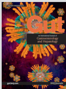
Caption: Hepatitis C virus. Computer artwork of hepatitis C virus (HCV) particles (virions), the cause of hepatitis C liver disease. Each virion has a symmetrical protein coat or capsid (blue), from which project surface protein molecules (orange) that help the virus attach to its target cell. The capsid contains strands of RNA (ribonucleic acid, not seen), the virus' genetic material. Hepatitis C is most commonly spread by blood contact, through blood transfusions or the sharing of infected needles. It causes inflammation of the liver with jaundice and flu-like symptoms. There is currently no vaccine for hepatitis C.

An international journal of gastroenterology and hepatology