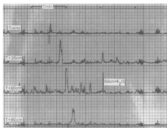
Fig. 1 Recording of jejunal motility in patients with ileoanal anastomosis: propagated contractions.

In healthy volunteers, propagated contractions were an infrequent pattern in fasting (one contraction every 180 minutes) and were never seen postprandially.