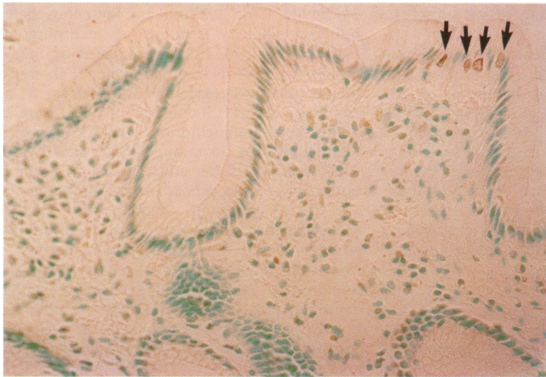
Figure 1: Photomicrograph of gastric antral biopsy specimen from a H pylori negative patient with non-ulcer dyspepsia. Occasional apoptotic cells are present in the most superficial area of the epithelium (arrows). TUNEL stain. Original magnification \times 400 .

epithelial apoptotic index was 14.1% (median 6.5, range 0–44), p=0.048 versus controls. After triple therapy, H pylori was cured in 12 of 16 patients and in these patients the mean apoptotic index fell from 16.8% (median 7.5, range 0–44) to 3.1% (median 1.5, range 0–18), p=0.017 , Wilcoxon signed rank test (Fig 3). In the four patients in whom H pylori was not cured, the apoptotic index fell from a mean of 6.8% (median 4.5, range 0–18) to 0.9% (median 1.0, range 0–1.5).