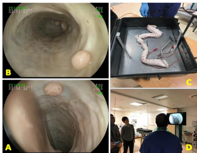
Figure 2 Images (A) and (B) are examples of the phantom polyps as viewed by the endoscope in the pig colon model. Image (C) shows the pig colon model being scoped. Image (D) shows the real-time endoscopy view during the experiment.

Polyp size is related to the risk of cancer and influences surveillance intervals and therapeutic approaches. 1 The 5 mm threshold is particularly important because it influences the implementation of optical diagnosis-based strategies including resect and discard/diagnose and leave approaches and also allows endoscopists to make therapeutic choices of cold versus hot polypectomy. 2 However, visual size estimation by endoscopists has a significant interobserver variability and error rate, 3 and other methods showed variable and sometimes contradicting results. 4